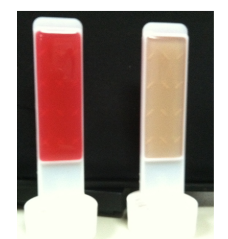
Figure 3. Representative dip-slide with double agar sides free of microbial contamination. This dip-slide was used to test the LoxaSperse dispersion for up to 24 h of environmental exposure.